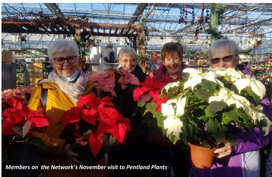
Members on the Network's November visit to Pentland Plants

The Network's recent move into larger premises on Bathgate's main shopping street (see page 3) couldn't have come at a better time as a highly visible base from which to launch our growth plans for 2022.