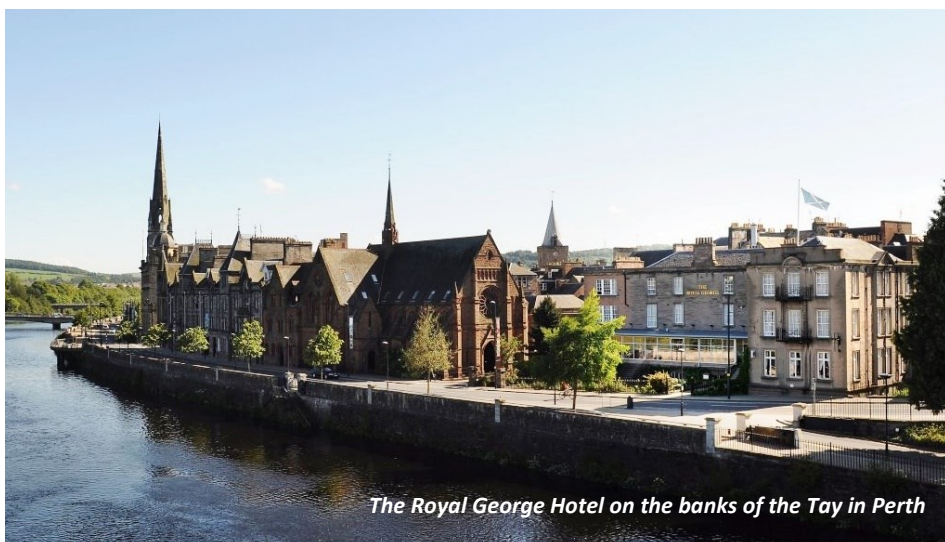
The Royal George Hotel on the banks of the Tay in Perth

We think we hit the mark in January when 48 members set off on what turned out to be a very fine day indeed, to visit the Scottish Antiques & Art Centre at Abernyste near Perth. We hit a slight snag when the high winds in the morning caused the Queensferry Crossing to be closed, necessitating taking an alternative, longer route to Abernyste and shaving a good half hour off our first stop. The Antiques Centre with its wide selection of antiques, collectibles, vintage furniture, jewellery and art did not disappoint, with some members bringing home some souvenirs, earmarking the centre for a future visit. The Royal George Hotel – and our lunch – beckoned, so it was on to Perth where we enjoyed an excellent three course meal, the dessert choice being particularly memorable, including everyone's favourite, sticky toffee pudding. Luckily, we had a couple of hours of free time after lunch to explore the city, with some taking the chance to walk off their meal with a stroll along the river, whilst others hit the city centre shops. We returned in daylight, able to enjoy the scenery and setting sun across the lovely Perthshire countryside.