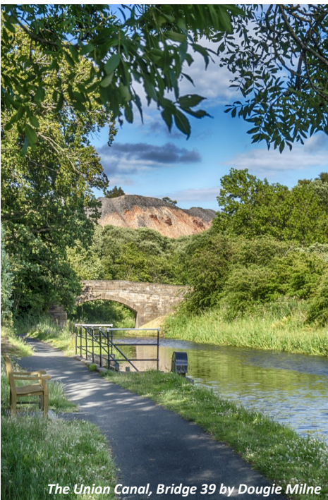
The Union Canal, Bridge 39 by Dougie Milne

In January 2020 we collaborated with local photographer Dougie Milne Photography who kindly allowed us to use four of his images of West Lothian landscapes to produce a set of birthday cards for our members.