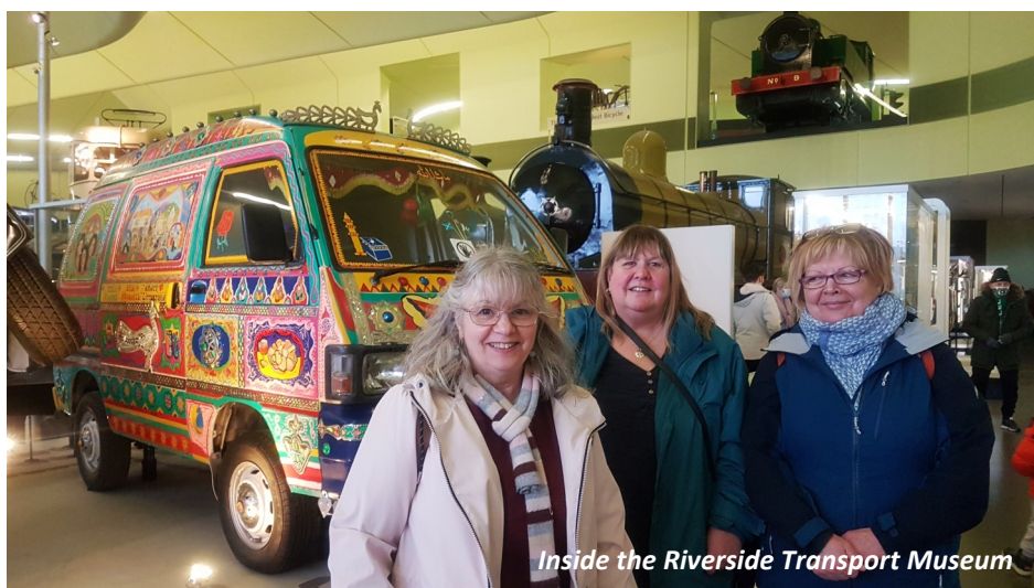
Inside the Riverside Transport Museum

The Life galleries represent natural history, human history and prehistory. The Expression galleries include the fine art collections. Further highlights are Rembrandt's 'Man in Armour', 'Christ and the Adulteress' by Titian and Salvador Dali's 'Christ of St John of the Cross'. The French Impressionists are well represented and Scottish art includes paintings by the Scottish Colourists and the Glasgow Boys.