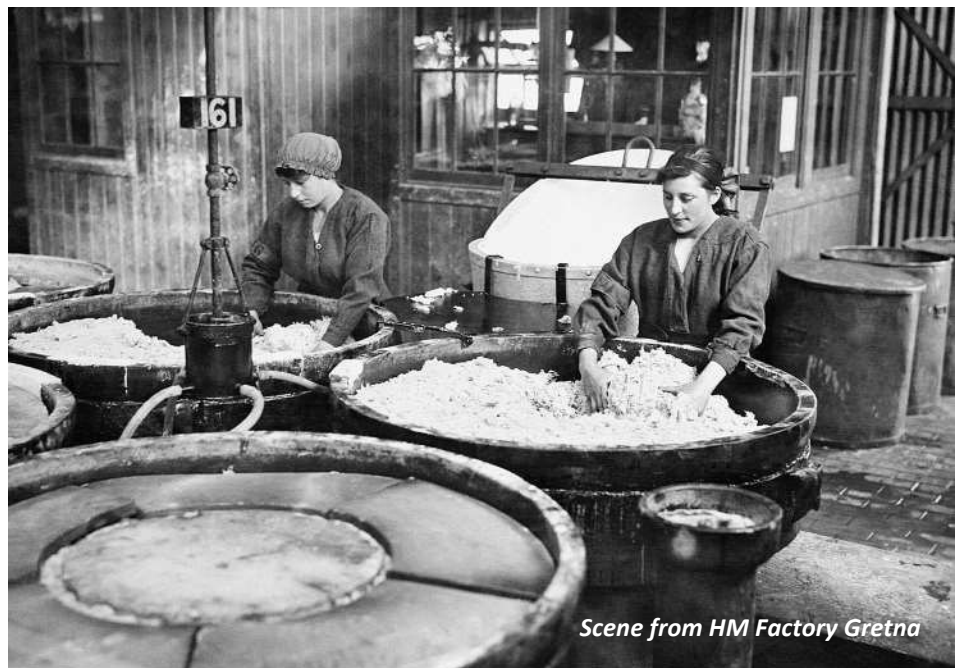
Scene from HM Factory Gretna

The Devil's Porridge Museum commemorates HM Factory Gretna. As a result of the lack of ammunition for British soldiers in France in May 1915, Lloyd George embarked on his greatest project HM Factory Gretna, a 9-mile site and the largest munitions factory in the world on the quiet Anglo-Scottish Border. Hundreds of chemists, explosive experts and some 12,000 females, predominantly young women were employed to manage the process from mixing the highly volatile 'devil's porridge' paste through to producing the finished cordite propellant, destined for the shell-filling factories. Sir Arthur Conan-Doyle coined the phrase 'the Devil's Porridge' after visiting as a War Correspondent and witnessing the Gretna Girls mixing this dangerous mixture. The museum explores the stories of the Solway Military Coast during the First and Second World Wars and beyond. We will have exclusive use of museum for 2 hrs, with introductory 10 min talk on coach if possible. The group will be divided into two, one looking around the ground floor whilst the other takes in the 1st floor, then vice versa. The cafe will be open. In the grounds outside are a locomotive, Anderson shelter and Dig for Victory garden. After our visit to the Museum, we'll