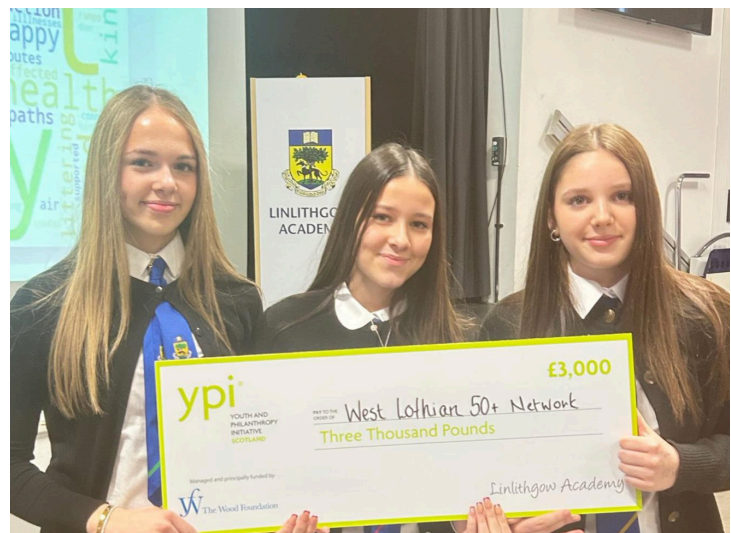
The successful team at Linlithgow Academy

This is a positive and strategic opportunity for the Network, strengthening both our local presence and our connection with younger generations.