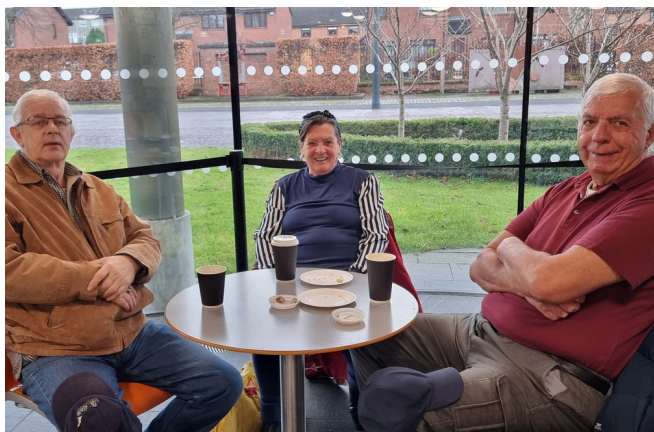
Members enjoying a day out at Summerlee Museum and Garrion Bridges