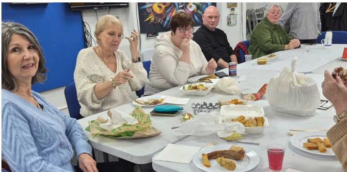
Our new monthly Sunday Social Supper in the hub