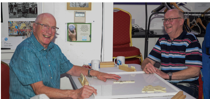
Members enjoying Monday's Darts and Dominos