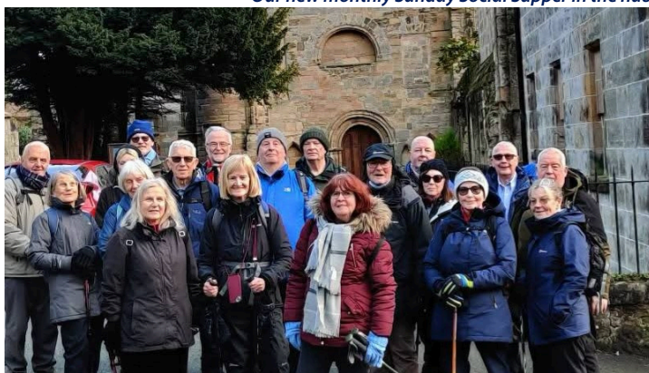
Miles and Smiles walk along the Fife Coastal Path